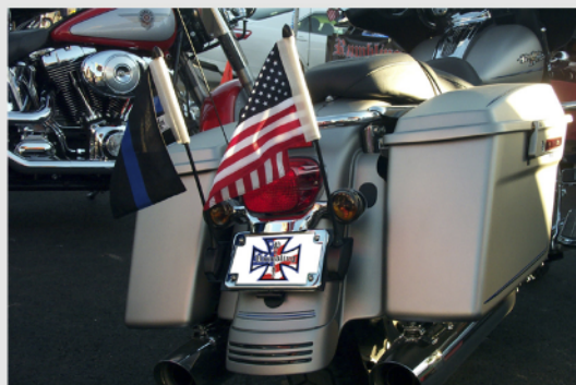
Ultra CCM Mounted on a Lay-down Plate Using Black TCM.22's