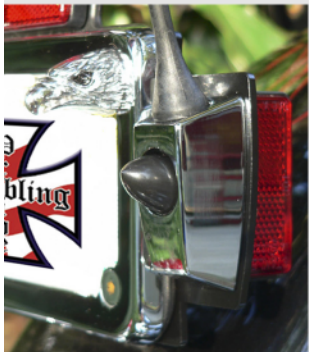
Close view using a TCM.22 mounted on a standard plate