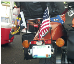
Display flags with a clean factory installed look