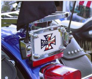
Ultra CCM using TCM.22's on a standard plate

2270 Griffin Road #353, Lakeland, FL 33810 ✦ Phone: 863-859-0LED (0533) ✦ Email: sales@rumblinpride.com