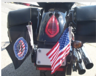
Ultra CCM using TCM.45's on a lay-down plate