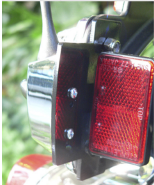
Back view of the Ultra conversion bracket installed